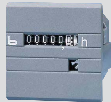
type 631.2, 631.3, 633.2, 633.3, 629.2, 629.3, 637.2, 637.3