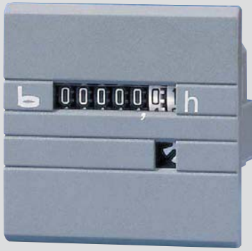
type 631, 631.1, 633, 633.1, 629, 629.1, 637, 637.1