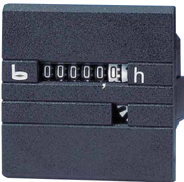
type 632, 632.1, 634, 634.1, 630, 630.1, 638, 638.1