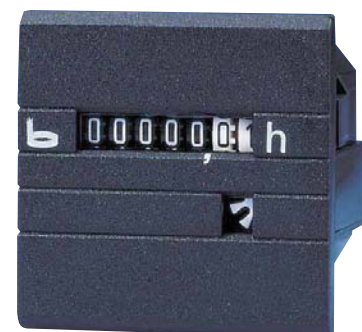
type 632.2, 632.3, 634.2, 634.3, 630.2, 630.3, 638.2, 638.3